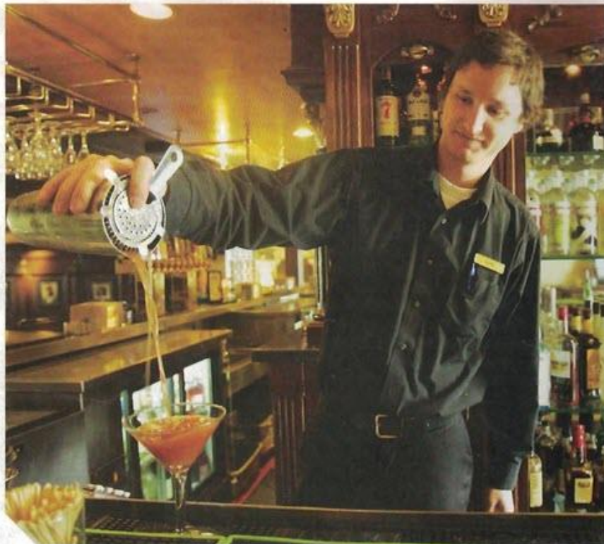
↑ PRESIDENTIAL LOUNGE

ladas or a burrito, these favorite Mexican food classics and more are on the menu at El Unico, a family-friendly restaurant located near the lake and city park in Lake Elsinore. Other favorites include chicken tortilla soup, the taco special, the carne asada burrito and the tortas. Feel free to dine on the casual outside patio (there is only outdoor seating) or if you are in a hurry, take your meal or snack to go and enjoy the food at home. El Unico is open seven days a week for a Mexican breakfast, lunch or dinner.